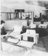
Showroom area, working displays